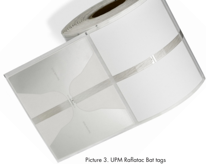
Picture 3. UPM Raflatac Bat tags

There are two principal passive UHF tag options available for paper roll tagging: the robust UPM Raflatac BAT tag for all paper roll sizes, and the UPM Raflatac DogBone tag for smaller roll sizes.