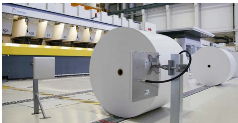
Picture 4. Paper rolls are identified on the conveyor after winding phase

Read points can be situated at different stages of the process and supply chain. A read point typically consists of 1 - 8 antennas, a reader device and suitable software for the application. Readers can identify the rolls by reading the data from the tag. Readers can also be used to encode more data to the tag, for example after the winding phase when information about the ready paper roll is transmitted to the tag.